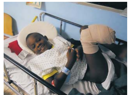
Always smiling, one of the many victims of the earthquake in Barahona, Dominican Republic.